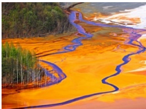
These are the most toxic places on earth. You'll never believe #5!