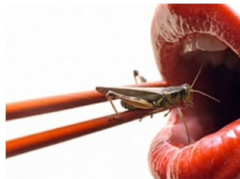
Amazing facts you probably don't want to know about!