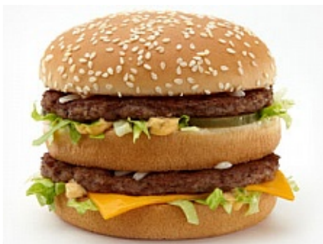
Surprising Facts About Fast Food Burgers. Did You Know?